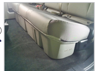
This is how the DU-HA should look installed under the back seat.

Pull the lever under each back seat to return the seat bottoms to the down position.